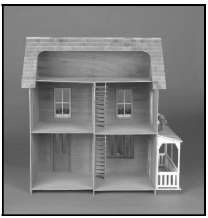
© 2001 Corona Concepts 436 Lake Road Schenevus, NY 12155